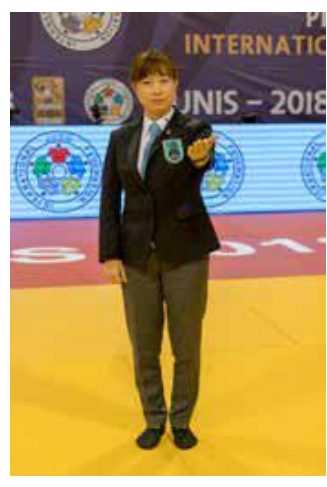
To call the doctor