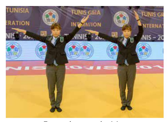
To cancel expressed opinion