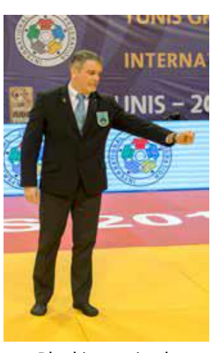
Blocking attitude with one hand