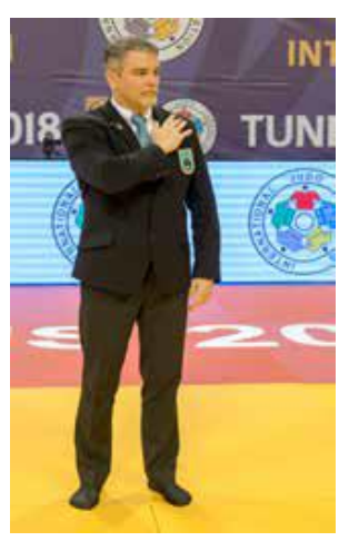
Refusing kumi-kata by covering lapel