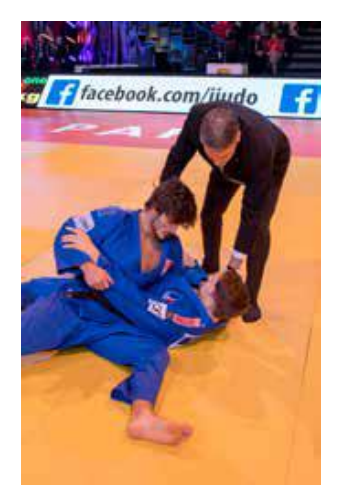
Sono-mama ⇔ Yoshi .