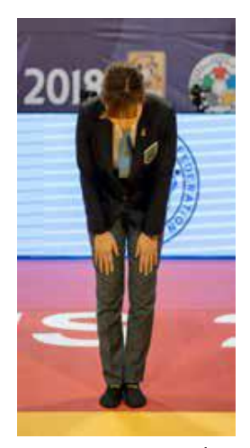
. Bow entering and leaving the tatami