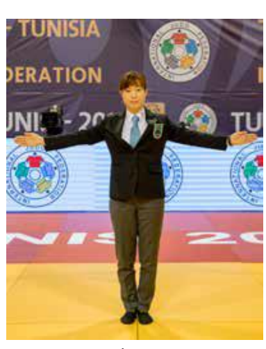
Inviting the contestants onto the tatami