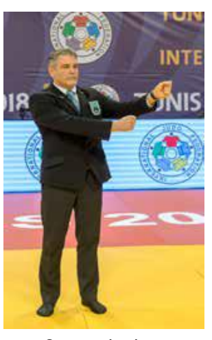
Cross gripping on one side